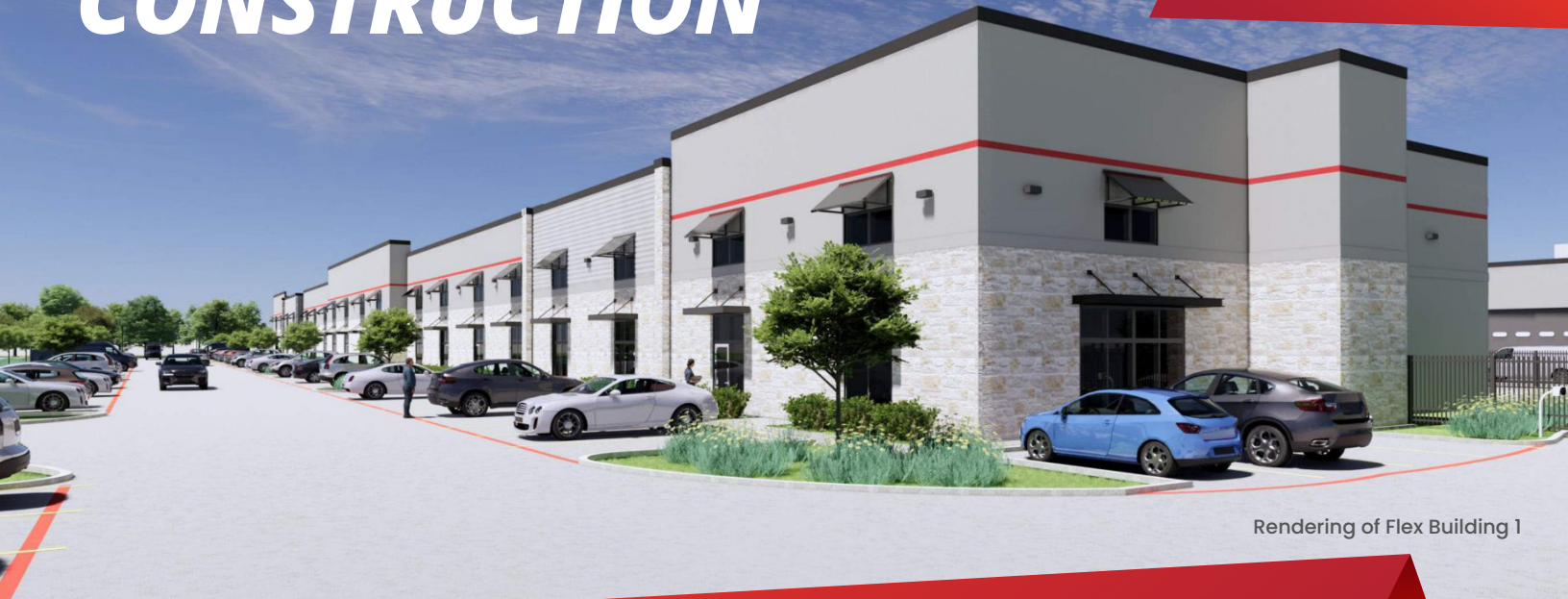
Rendering of Flex Building 1